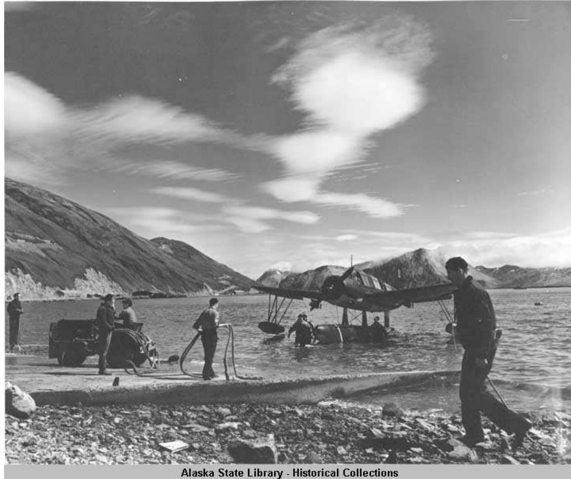
Alaska State Library - Historical Collections

Alaska Immigration Justice Project 907-279-2457