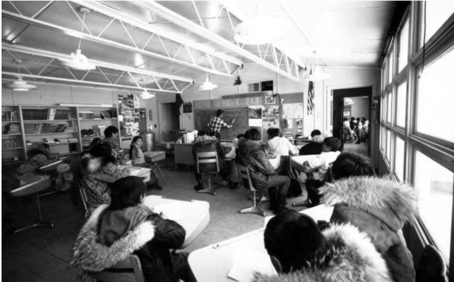
Anchorage Museum of History & Art. Library & Archives.

Alaska Immigration Justice Project 907-279-2457